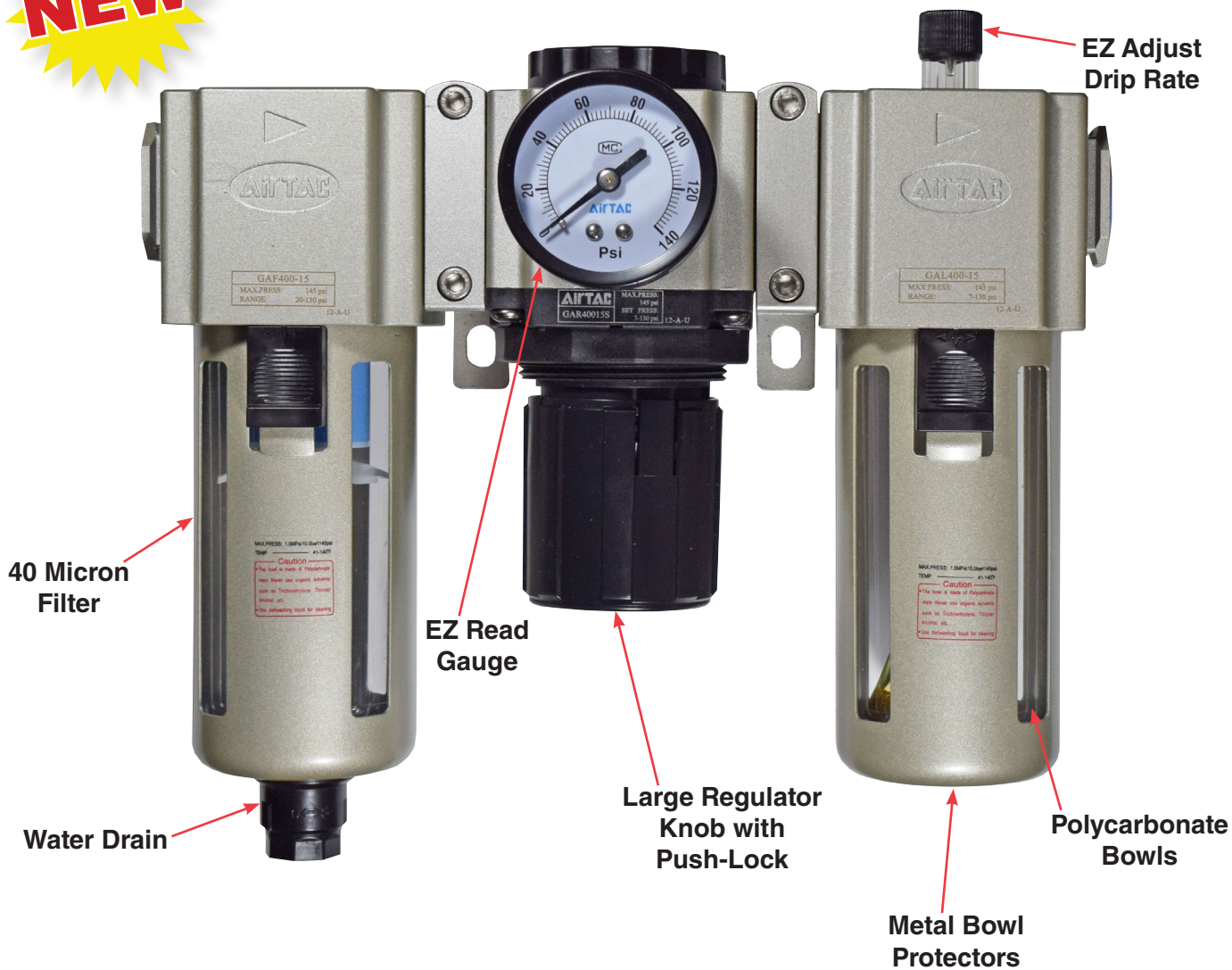
Filter, Regulator, Lubricator Assembly